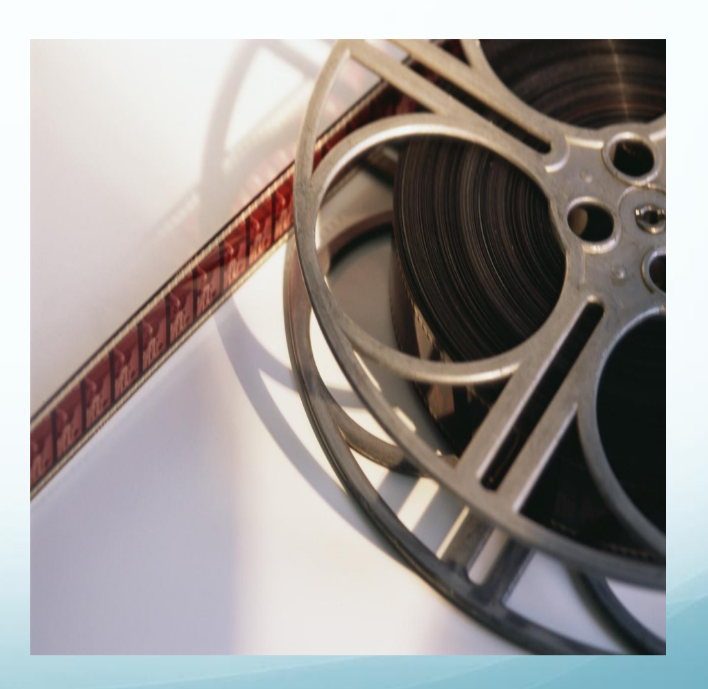
Ninth Grade Algebra – Power Teaching <a href="http://youtu.be/h6WJdsb0dfM">http://youtu.be/h6WJdsb0dfM</a>